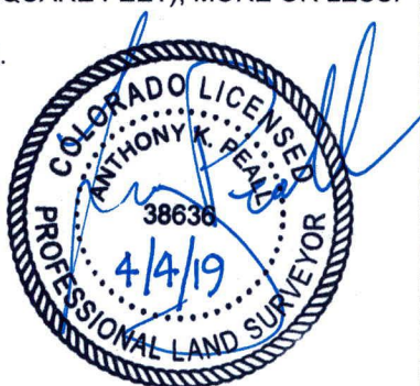
EXHIBIT ATTACHED AND MADE A PART HEREOF.