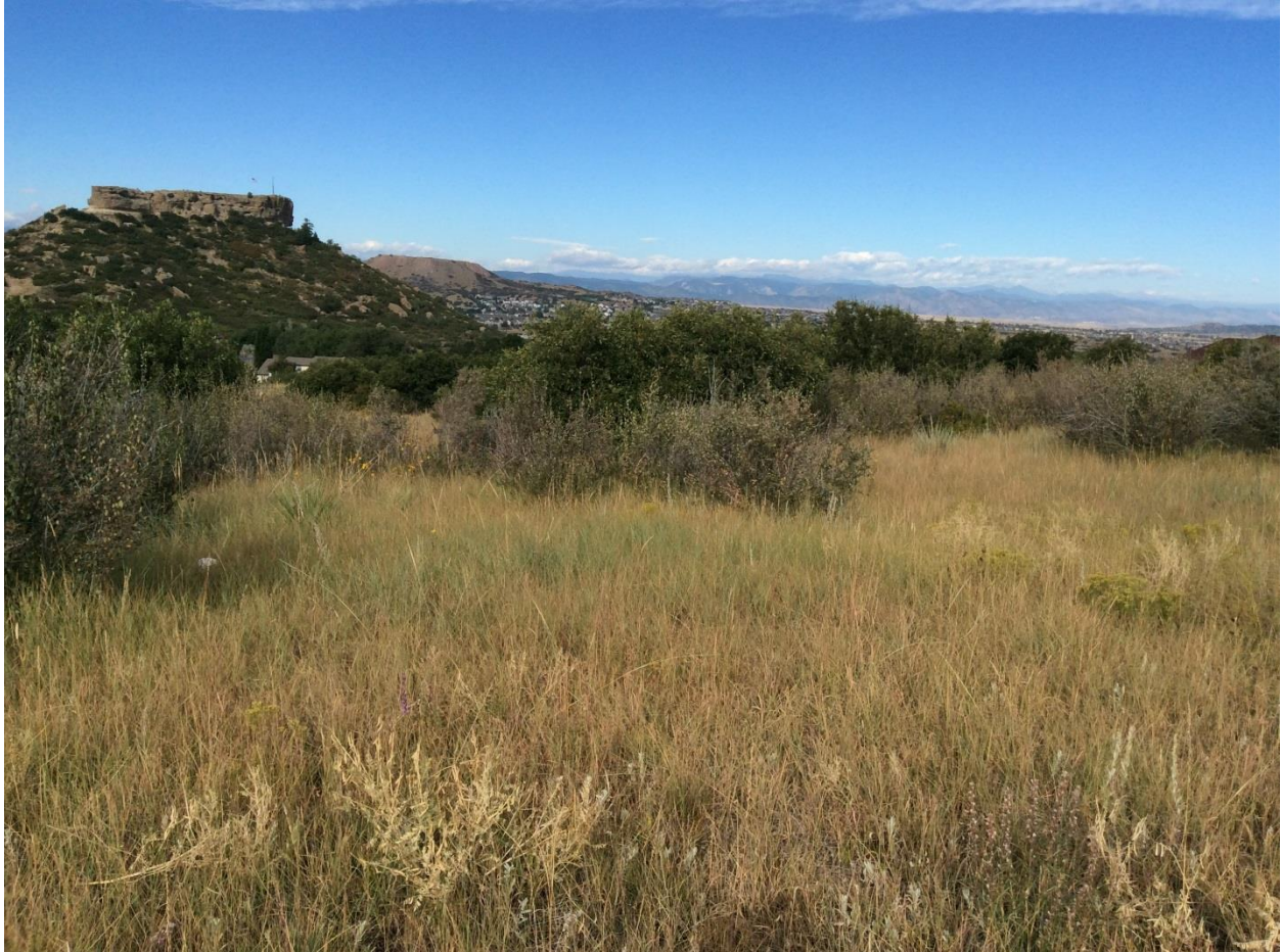
View from Proposed Site to the West

The PD zoning will be applicable to the 5.4 ± acre parcel located at the northwest corner of Fifth Street and Woodlands Boulevard. The proposed PD zoning with the allowable use of a church is well-suited for the location at the intersection of two arterial streets. The zone district is compatible with existing development on adjacent properties and measures will be taken within the Site Development Review process to mitigate any incompatibility as the parcel is subject to the Residential/Nonresidential Interface regulations.