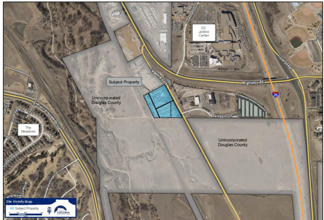
Figure 1: Vicinity Map

Kim Barrett, KGCB Industries, owner, has submitted a petition for annexation to the Town along with an application to be zoned General Industrial (I-2). The property consists of four parcels, totaling 5.34 acres, located on Liggett Road south of the State Highway 85 and Liggett Road intersection (Figure 1 and Attachment A). The William Warren Group is under contract to purchase the property with the intent to redevelop the site and construct a StorQuest self-storage facility with outdoor recreational vehicle (RV) storage. Castle RV & Mini-Storage is currently operating on the site.